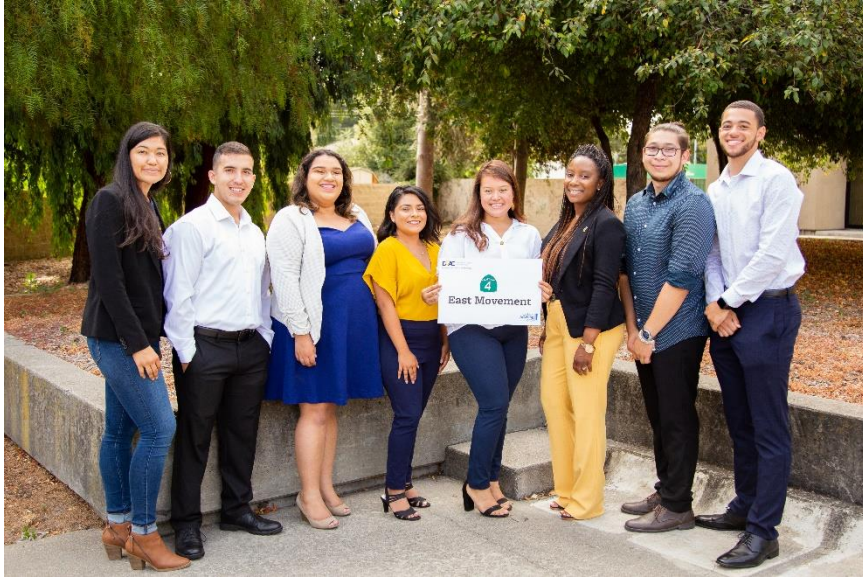
EAOP/DCAC College Adviser East Contra Costa County Team