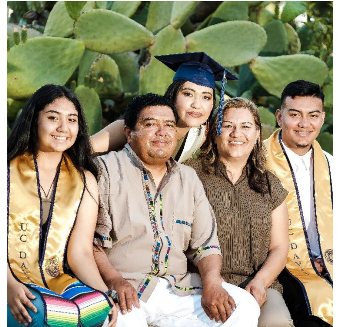
UC Davis Alumni 1 st Generation